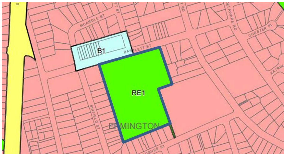
Figure 4 – Site of Ermington Possum Patch Childcare Centre

The Planning Proposal is required to address the current development and expansion constraints of four existing Child Care Centres (Items 1, 2, 3 and 4) on land zoned RE1 Public Recreation under the PLEP 2011. These are currently operating under existing use rights as they were approved under a different zoning under the superseded LEP which permitted this use. As a result there is no opportunity to expand and redevelop these centres irrespective of community demand due to the current RE1 zoning which prohibits Child Care Centres under the PLEP 2011.