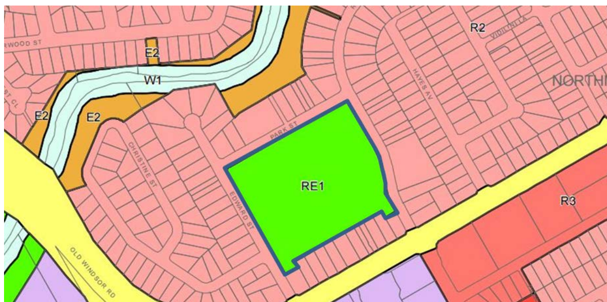
Figure 3 – Site of Northmead Redbank Childcare Centre