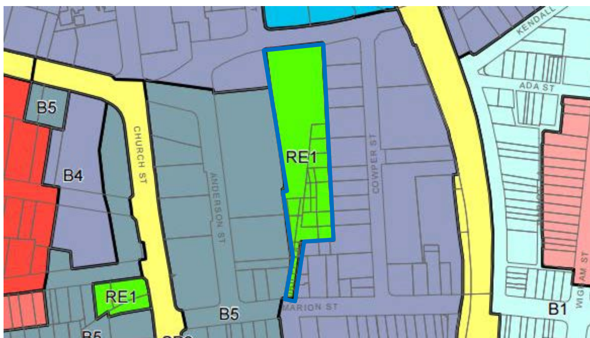
Figure 1 – Site of Jubilee Park Child Care Centre